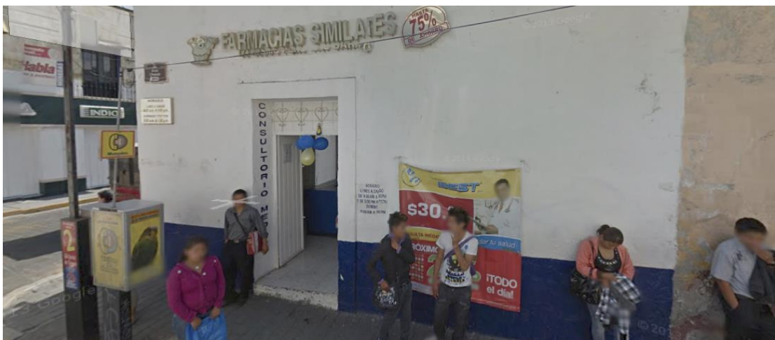
IMAGE OF THE BUS STOP/PHARMACY

The way back is a bit trickier. The closest place to the Zócalo (main square) to pick the bus up is the above mentioned corner between "Miguel Alemán" and "5 Oriente" streets (the corner with the pharmacy). The problem is that, in this case, many buses stop in this corner. Again we can choose between the red bus (6 pesos) or the "combi" (5 pesos), but we MUST BE SURE that is the one in which we can read TONANTZINTLA/INAOE in the black and coloured panels. The buses commonly have all their destination written in their front glass, but is their direction that is written in the black panels. Those are the one we must pay attention to! Anyway, to be sure you can ask the driver. They are familiarized with the INAOE. :D